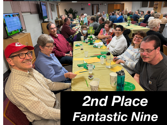
2nd Place Fantastic Nine