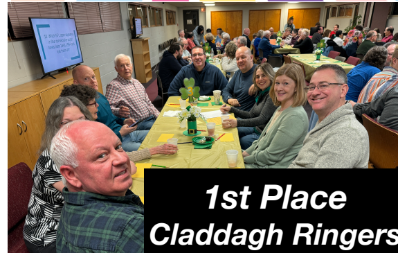
1st Place Claddagh Ringers