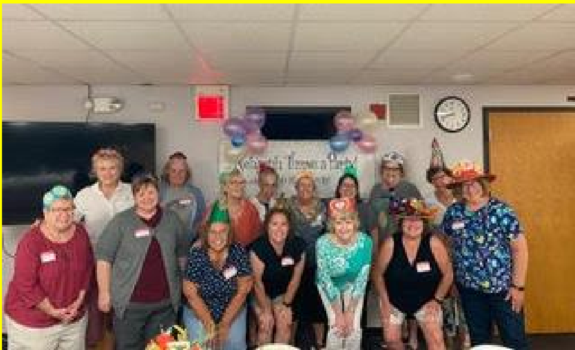
UWF Sept 6 Meeting