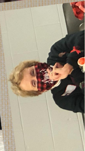
UMW Holiday Meeting