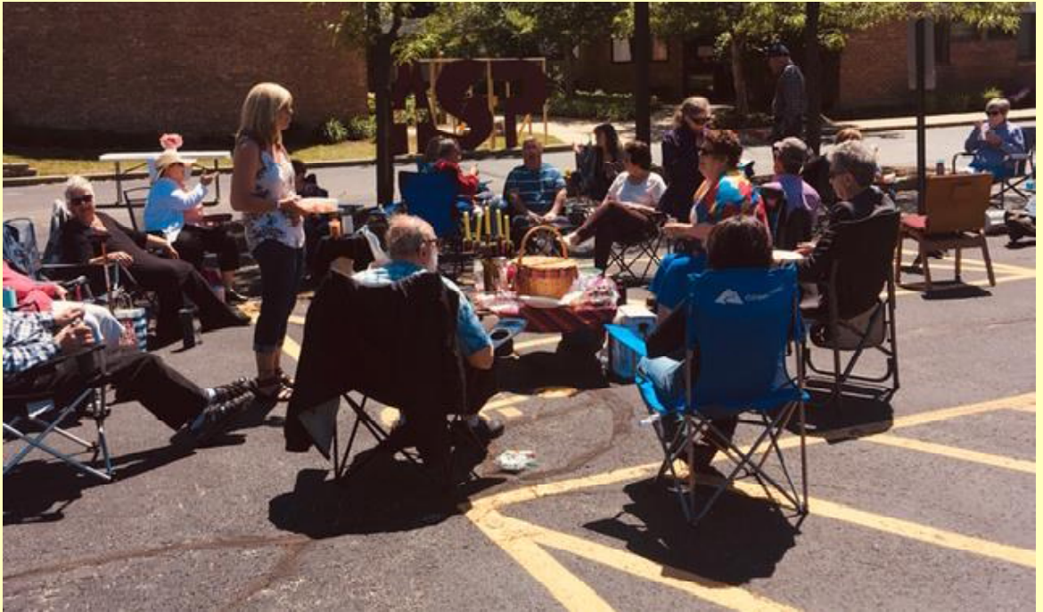
Ravinia Style Music (and snacks) after church May 30