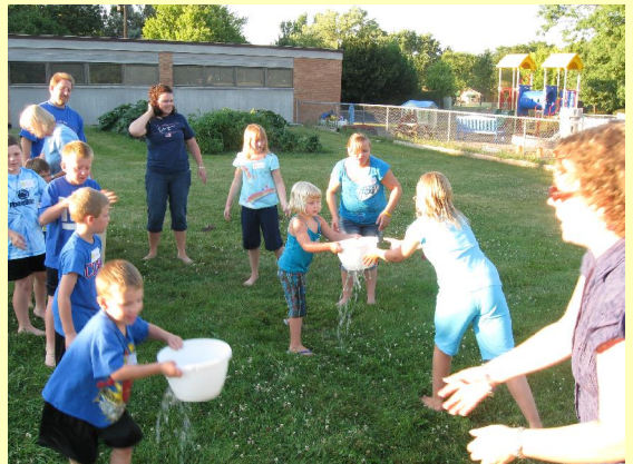
Previous Vacation Bible School Activities