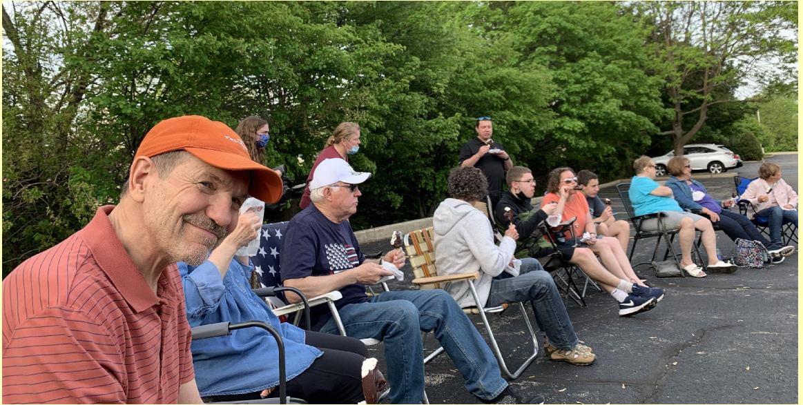
Choir Ice Cream Social May 19