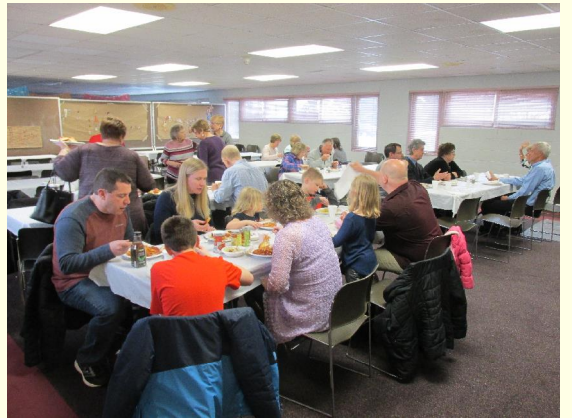
UMM Spaghetti Dinner February 3