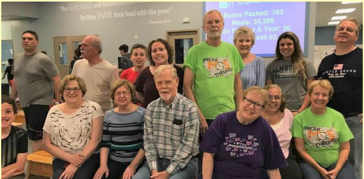
UMW at Feed My Starving Children June 17

Trivia Night 2020- We will schedule our 2nd Annual Trivia Night for early next year.