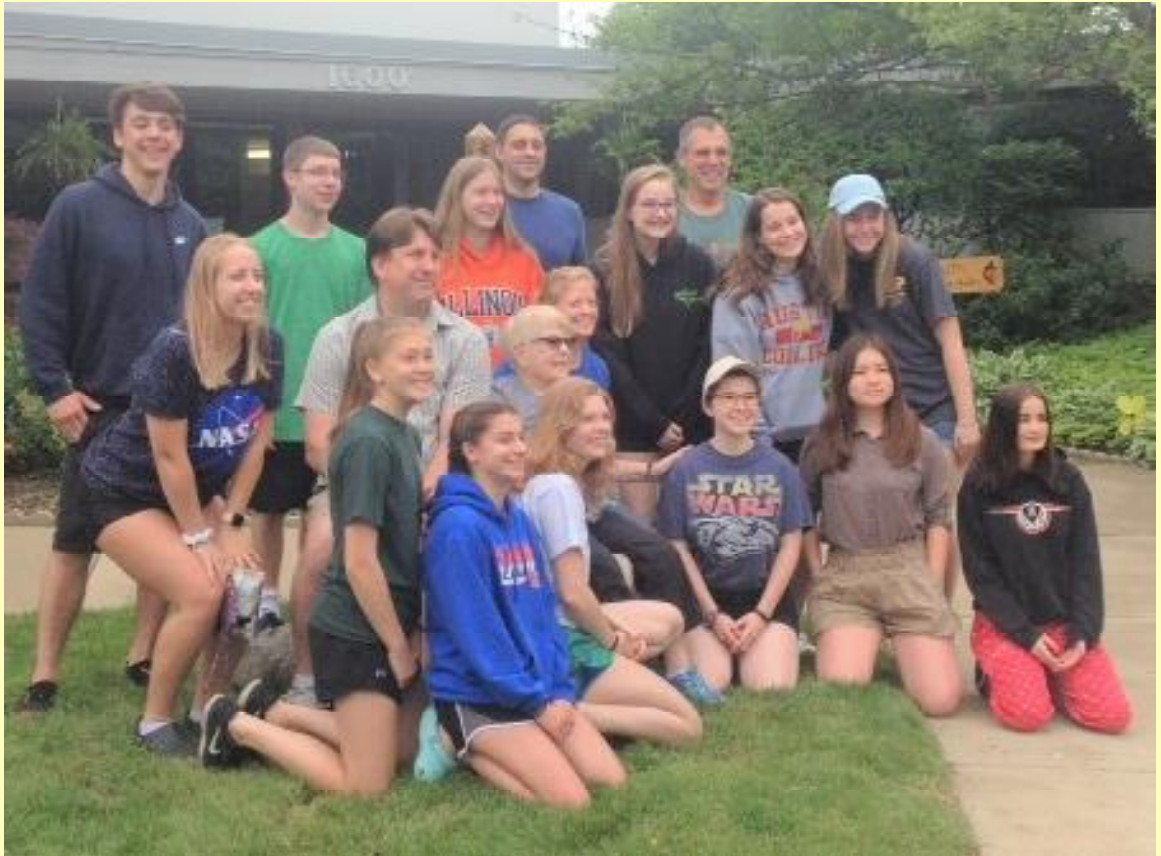
ASP Departure - June 15

Rally Day is September 8 so can't wait to see everyone for the first day of Sunday school!