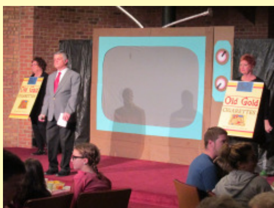
TVLAND - 20 Questions