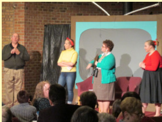
TVLAND - Patty Duke Show