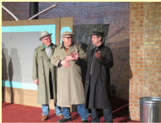
TVLAND - Dragnet