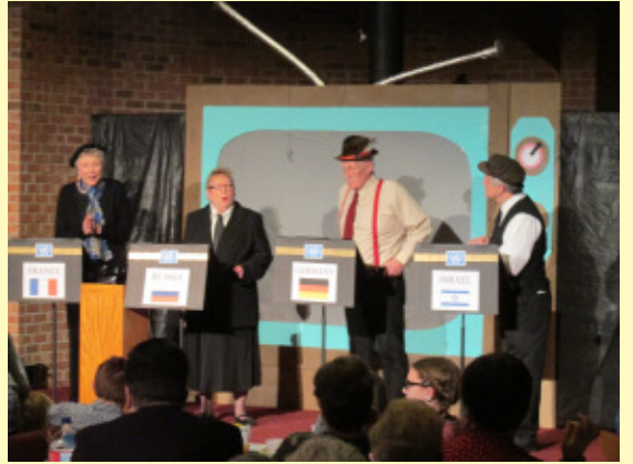
TVLAND Twilight Zone