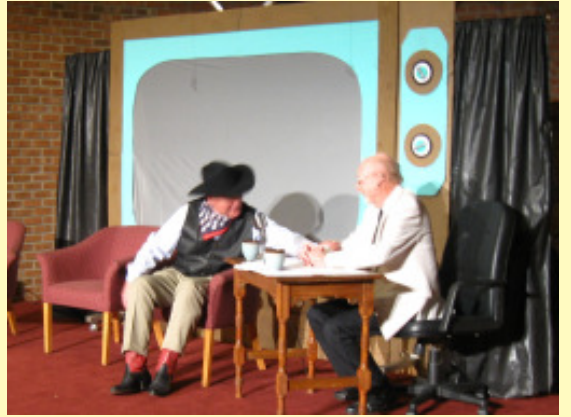
TVLAND Tonight Show - Kate Smith & John Wayne