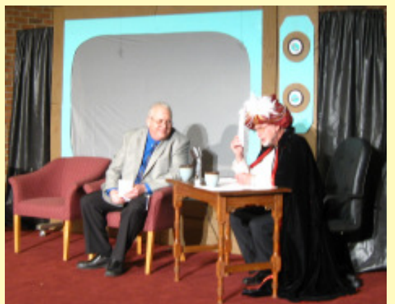
TVLAND Tonight Show - Minnie Pearl & Carnac