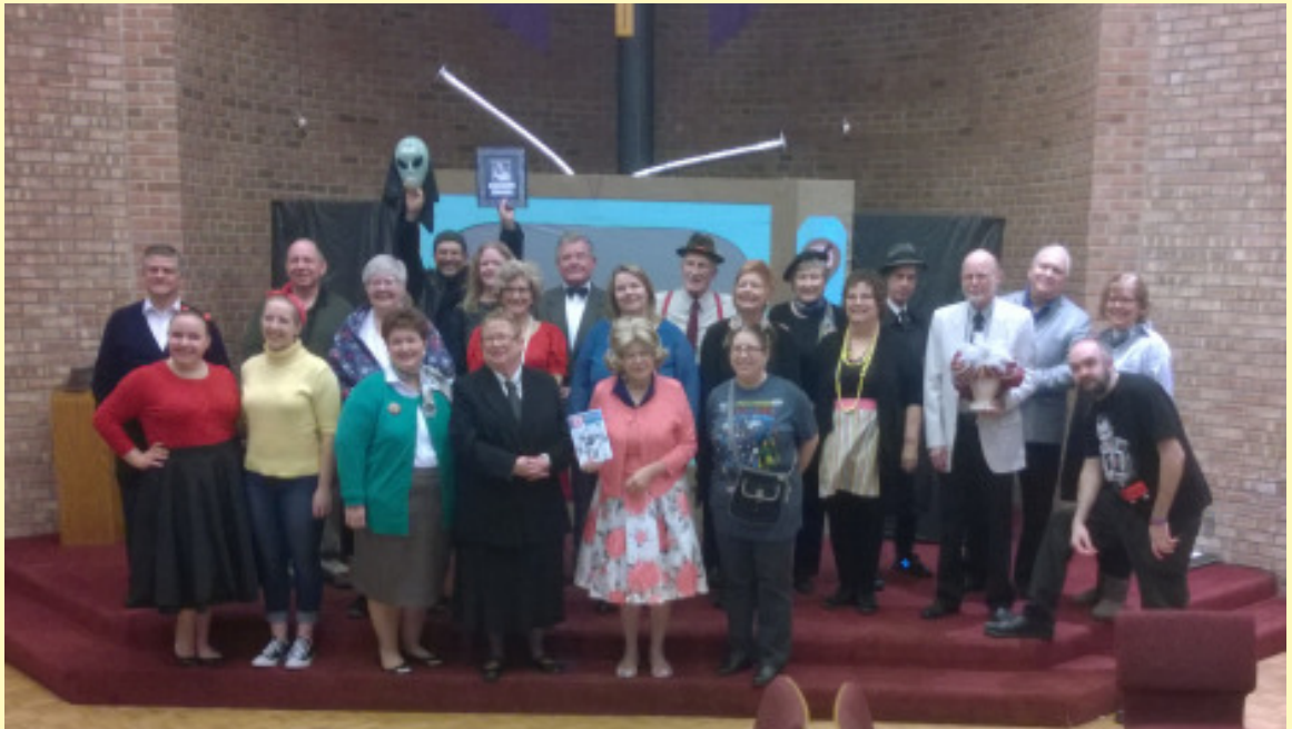
TVLAND Cast and Crew