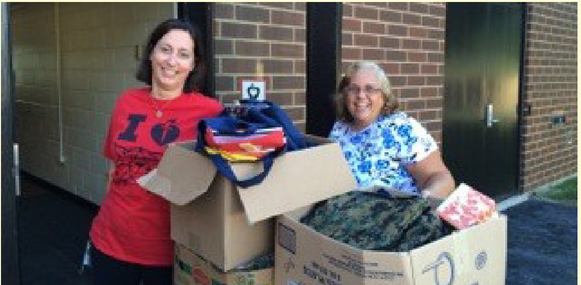
Delivering Finished Bags to Blackwell School

Tuesday, December 6 – Holiday Potluck Dinner & Business Meeting - 6:30 p.m. in the Wesley Room / Program: "Holiday Happenings" / White Elephant gift exchange / 2017 Budget & 2016 Allocations to Missions