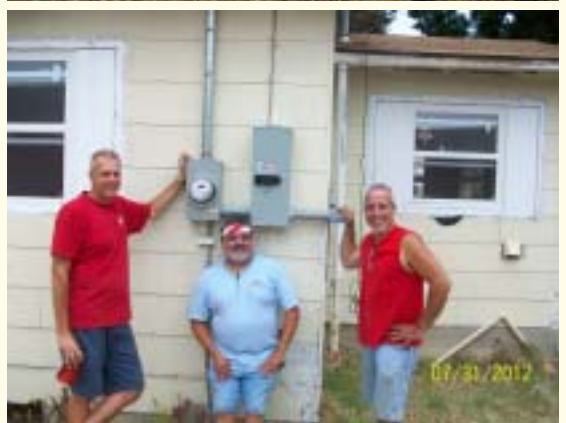
Joplin Mission Trip