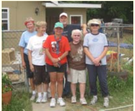
Joplin Mission Trip