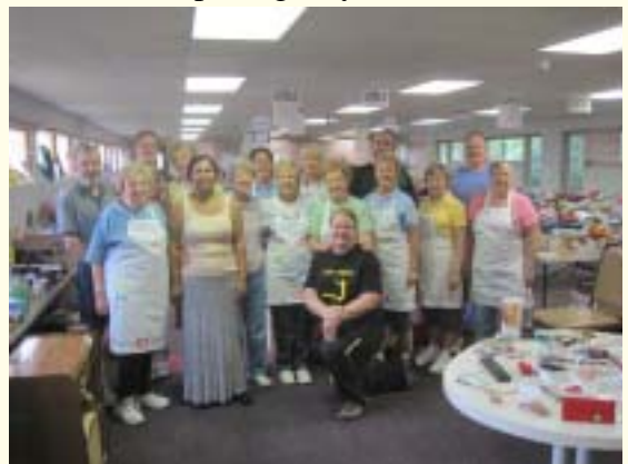
The Rummage Crew