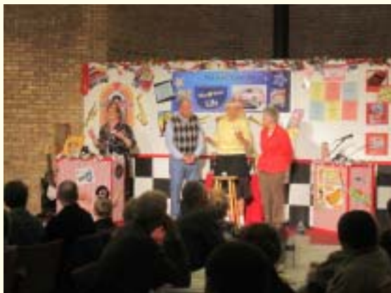
Audience in “Name That Tune”