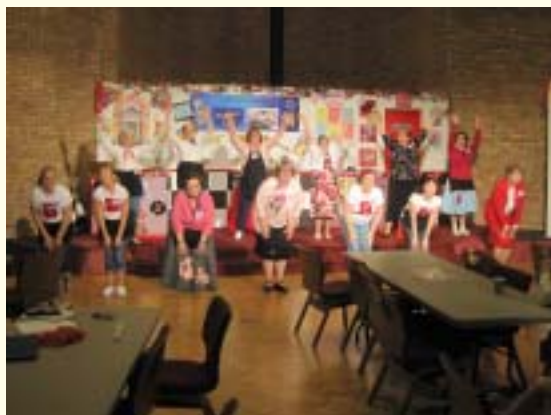
The Girls Singing & Dancing