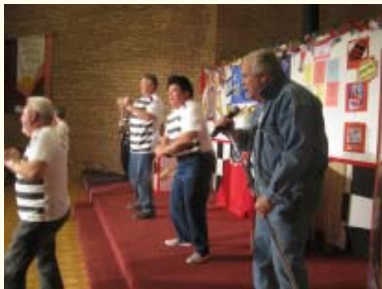
The Guys Singing & Dancing