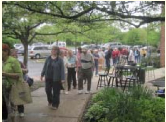
Opening Day Crowd