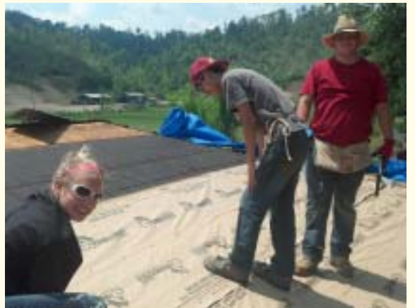
ASP Kentucky 2012