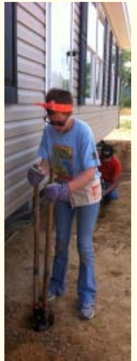
ASP Kentucky 2012